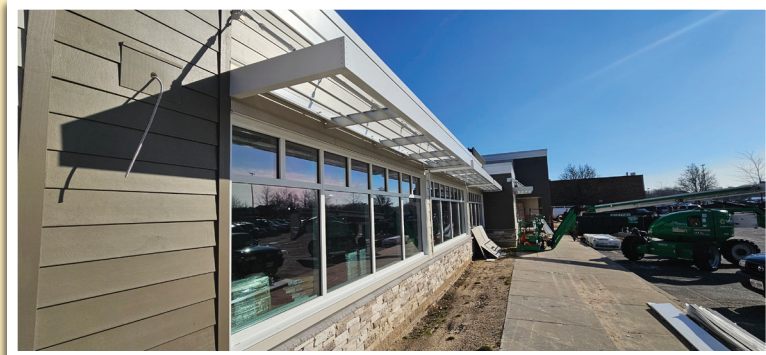
Construction at the Main Library at 407 William Floyd Parkway continues to progress month by month, with much of the exterior work finished including siding and windows.

You can also visit the Town of Brookhaven Assessor's Office sample tax bill for help understanding your statement: https://tinyurl.com/mpswxmh