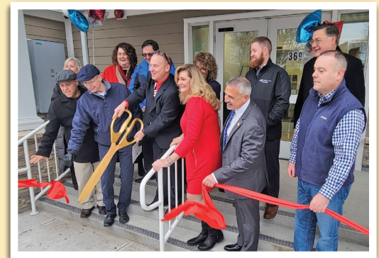
The Mastic Beach satellite branch opened its doors on January 14. The beautiful, new 7,000-square-foot building has been a welcome addition to downtown Mastic Beach.