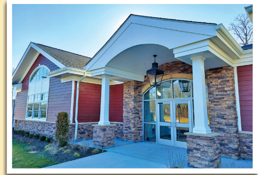
Construction of the new Moriches satellite branch is complete. Books, supplies, and furniture have been moved in. The town has issued its Certificate of Occupancy. We are awaiting final land division approval from the school district.