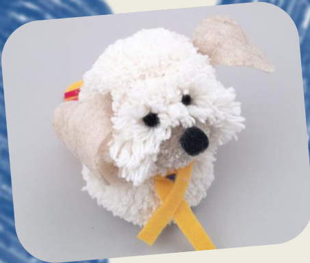
Shaggy Yarn Dog Craft from Handmade Charlotte Click here to get started!