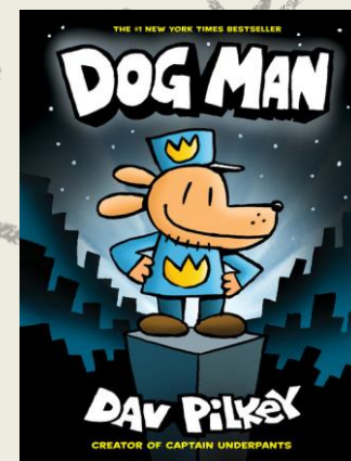
Dog Man by Dave Pilkey Check it out!