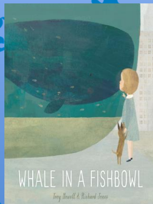
Whale in a Fishbowl by Troy Howell Check it out!